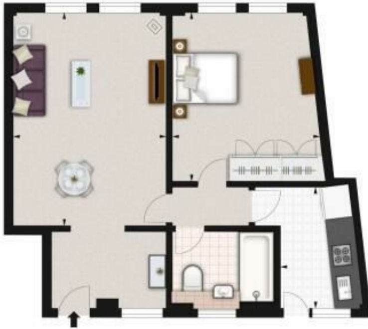
ILLUSTRATION FOR IDENTIFICATION PURPOSES ONLY. NOT TO SCALE * As Defined by RICS - Code of Measuring Practice

APPROX. GROSS INTERNAL AREA * 561 Ft 2 - 52.12 M 2